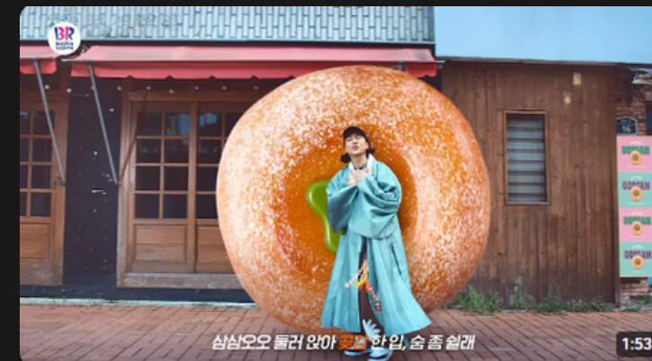
베스킨라빈스 X 넉살