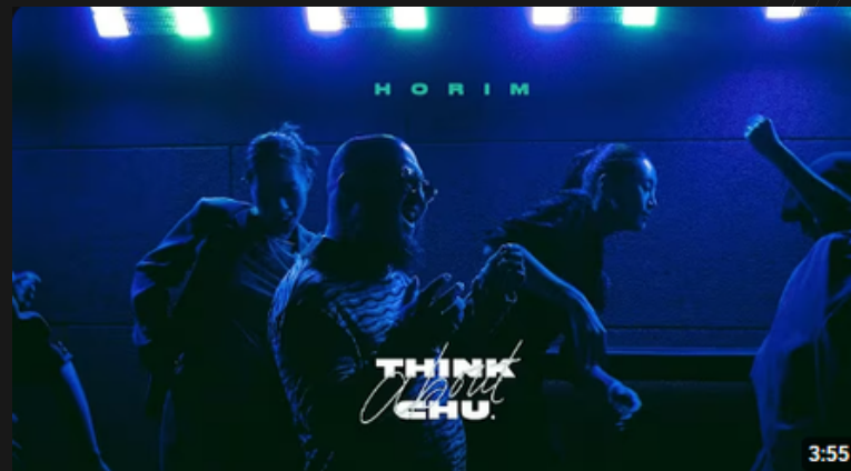
Horim - Think About' Chu