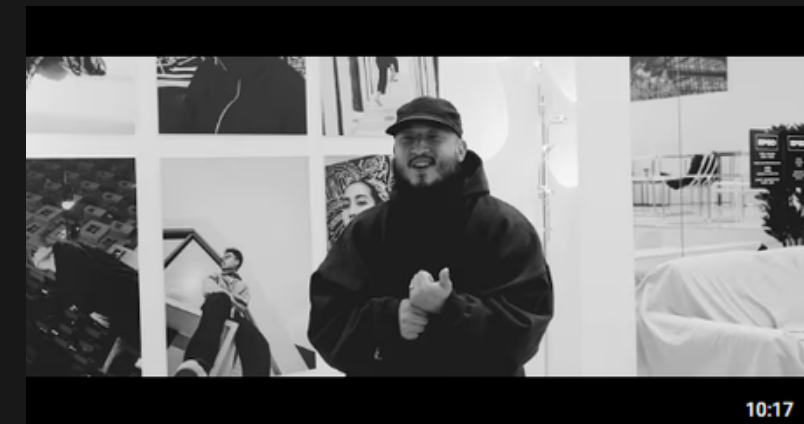
EPSD : WWDD