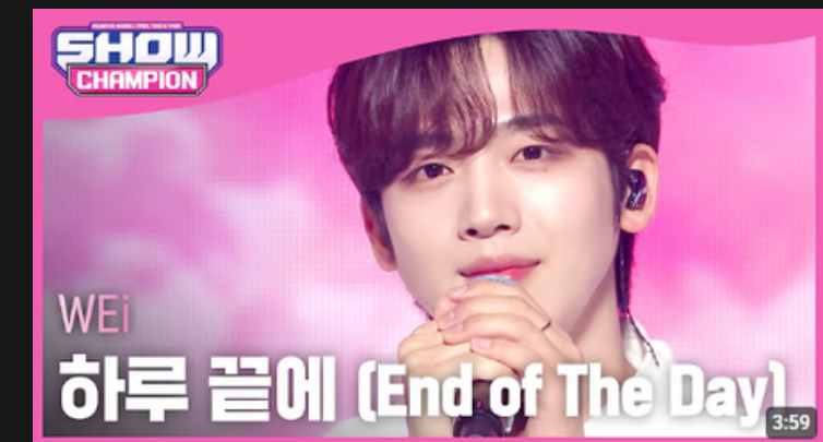
WEi - 하루 끝에 (End of The Day)