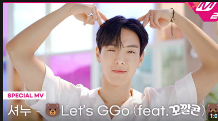
롯데 꼬깔콘 X 서누