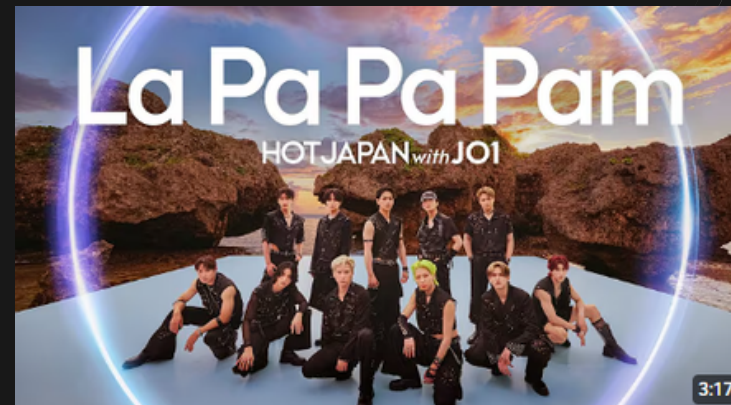
JO1 - La Pa Pa Pam (Japan Oricon Chart No.1 Album)