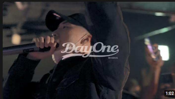
Kohway - Homecoming Ep.00 : Songtan, Korea