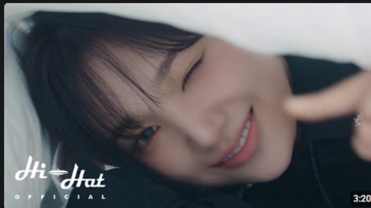
ifeye - NERDY