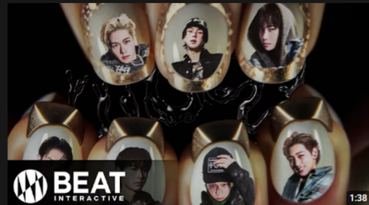
NEWBEAT - HICCUPS