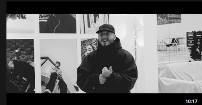
EPSD : WWDD