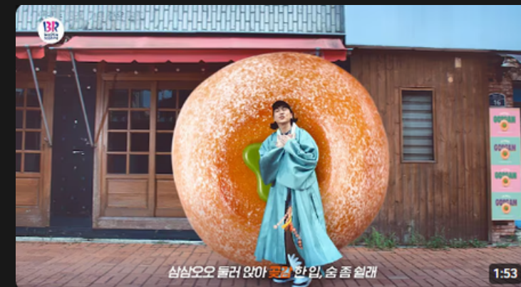
베스킨라빈스 X 넉살